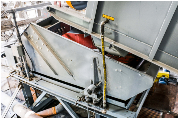
RECYCLE WATER LINE