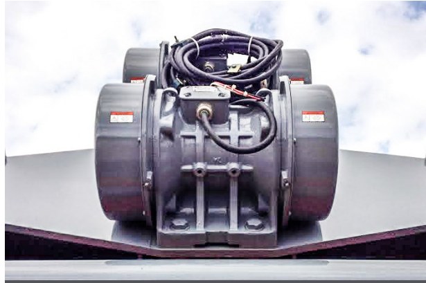
DUAL ELECTRICAL VIBRATORS