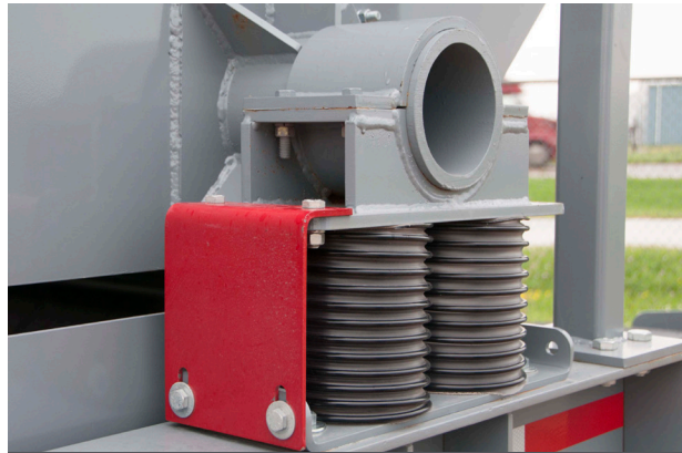
STEEL COMPRESSION SPRINGS