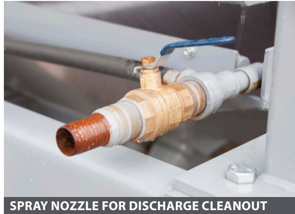
SPRAY NOZZLE FOR DISCHARGE CLEANOUT