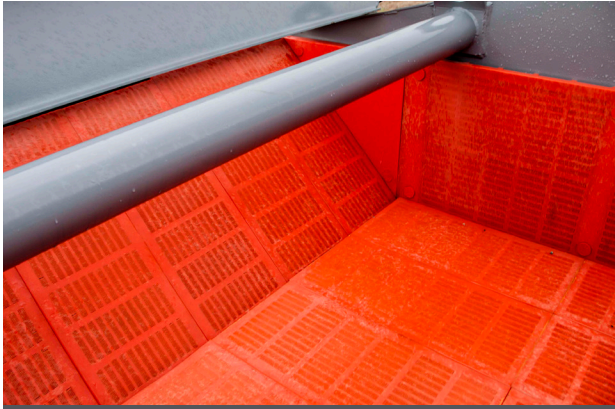
SCREEN URETHANE SIDE WALLS