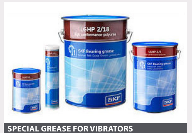
SPECIAL GREASE FOR VIBRATORS