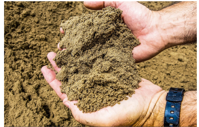
8% MOISTURE CONTENT