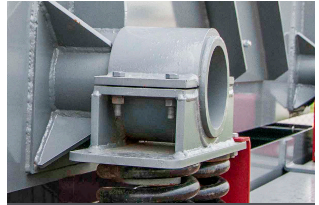
EASILY CHANGE ANGLE