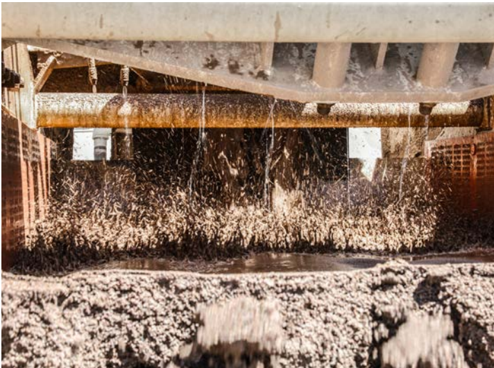
05/ SPRAY BARS