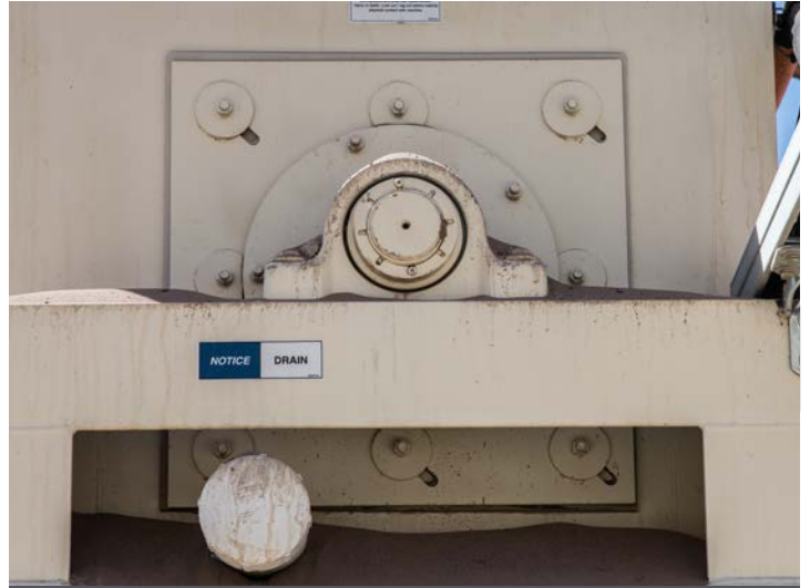
02/ SAFEGUARD OUTBOARD BEARING