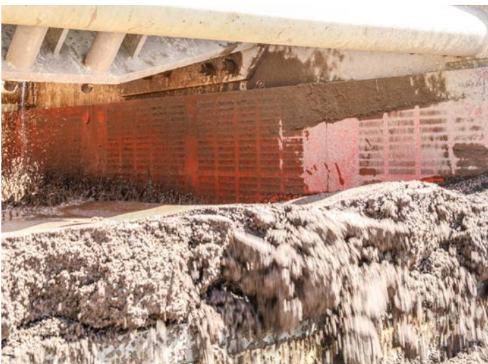
URETHANE SIDEWALL MEDIA