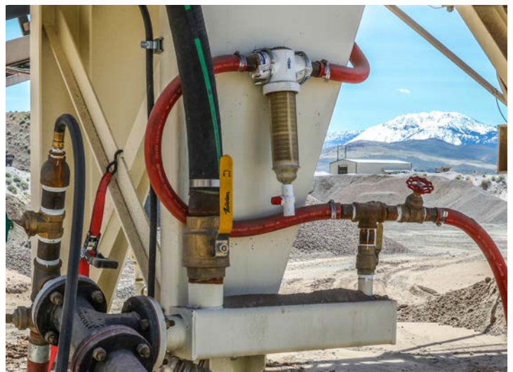
FLOW METER AND VALVE