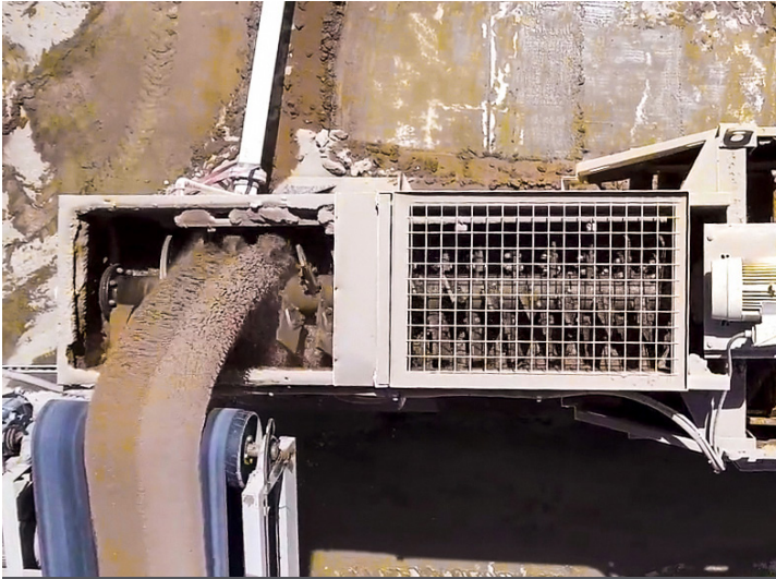
01/ AGITATOR SECTION