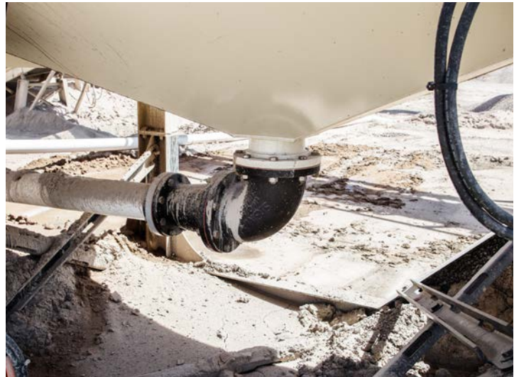
06/ REMOVABLE UNDERFLUME