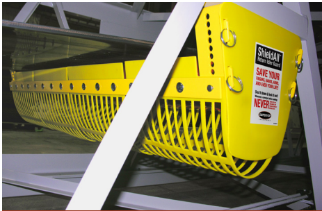
SHIELDALL™ RETURN GUARD