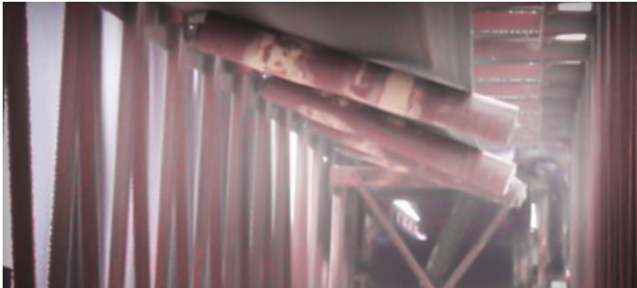
PROTECT YOUR CREW FROM FALLING RETURN ROLLS