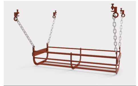
RETURN IDLER BASKET