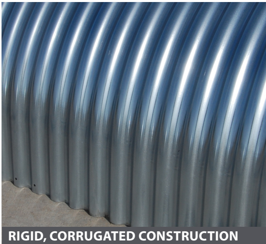
RIGID, CORRUGATED CONSTRUCTION