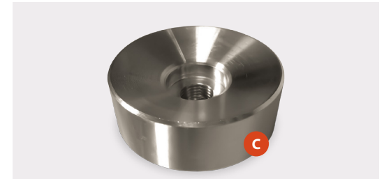
TOP VIEW OF STEEL ADAPTOR