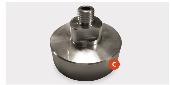
BOTTOM VIEW OF STEEL ADAPTOR