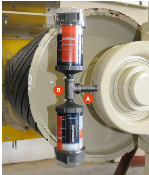
45° ELBOW AND 90° TEE AVAILABLE